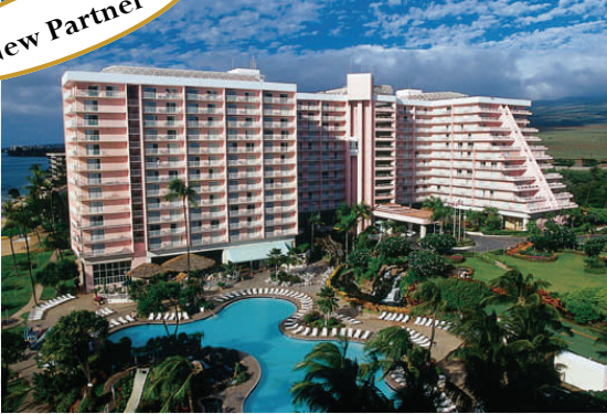
THE KA'ANAPALI BEACH CLUB IN MAUI, HAWAII

Brownstone Security provides security officers and security guards for a variety of clients including retail facilities, industrial facilities, shopping centers, home owner associations, office complexes, government agencies and a variety of other industries. If you do not need full-time security officers/security guards then Brownstone Security can provide you with security patrol services that can patrol your property on a random basis or remote video monitoring of your facilities. For the retail industry Brownstone Security can provide Loss Prevention services in order to deter theft. In addition to these services Brownstone Security can provide a full spectrum of safety consulting and security consulting services. Brownstone Security, a Security Partnership founded in trust and service.